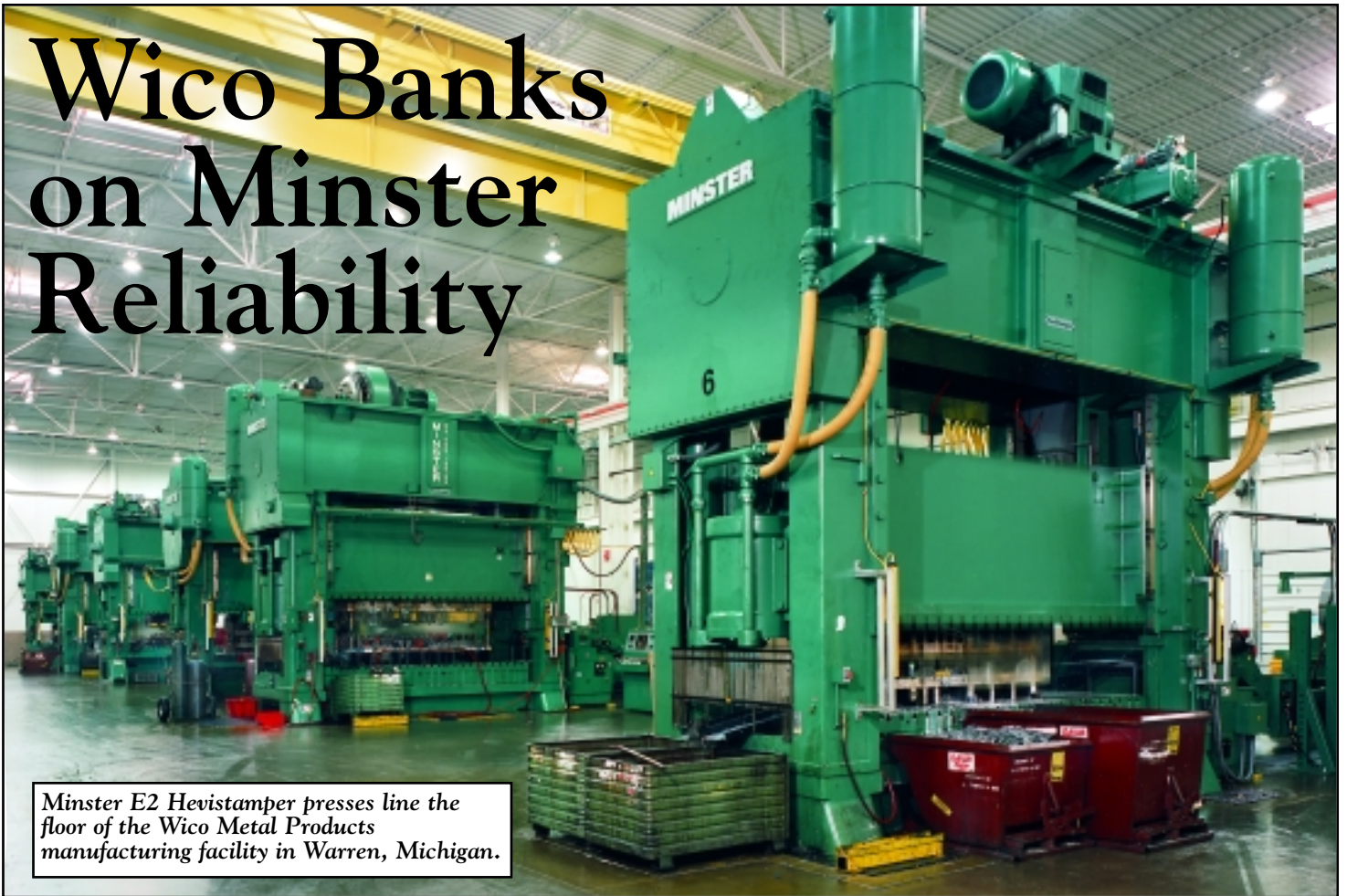
Minster E2 Hevistamper presses line the floor of the Wico Metal Products manufacturing facility in Warren, Michigan.