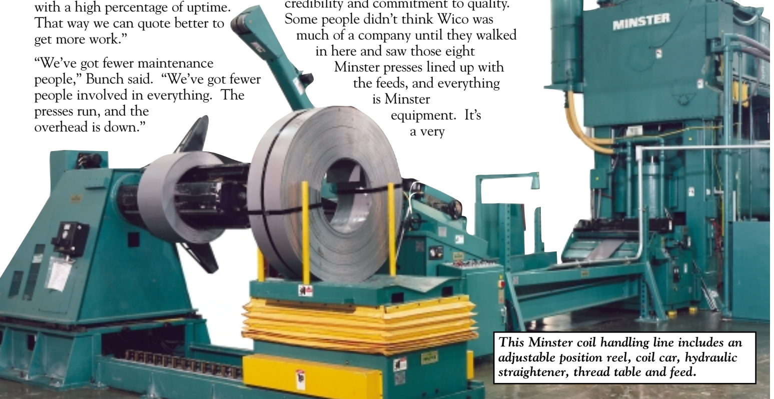
This Minster coil handling line includes an adjustable position reel, coil car, hydraulic straightener, thread table and feed.

impressive sight for people who know presses, and that fact alone has gotten us additional business.”